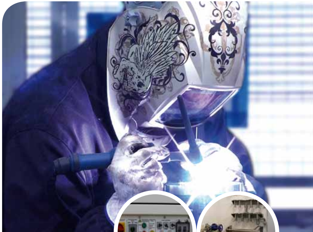
The TIG Welding machine allows us to weld sheets of up to 40mm without pre heating.